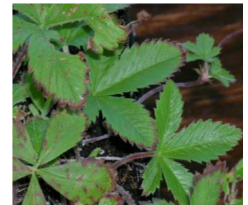
Old field cinquefoil (P)

Key: A – annual, B – biennial, P - perennial