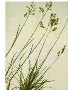
Red fescue (P)