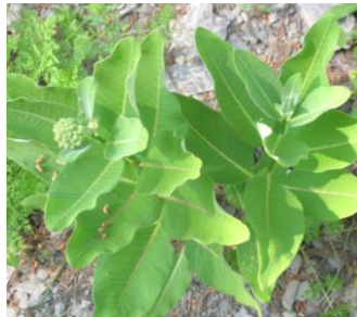
Common milkweed (P)