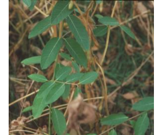
Hemp dogbane (P)