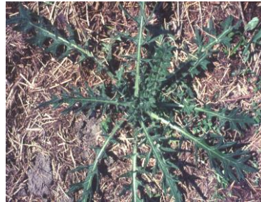
Bull Thistle (B)