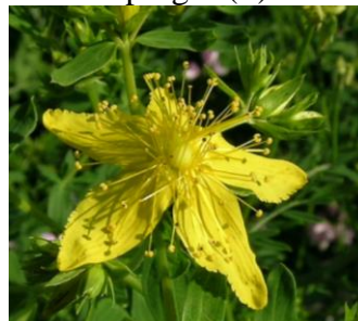
St. Johnswort (P)