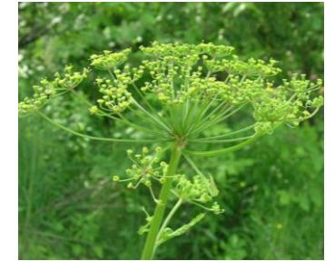
Wild parsnip (B)