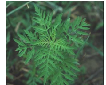
Common ragweed (A)