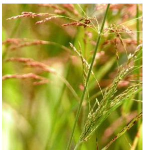
Redtop grass (P)