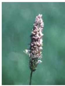
Meadow foxtail (P)