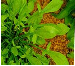
Red Sorrel (P)