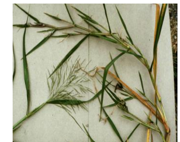
Fall panicum (A)

Key: A – annual, B – biennial, P – perennial