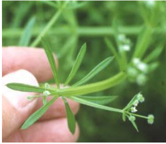
Smooth bedstraw (P)