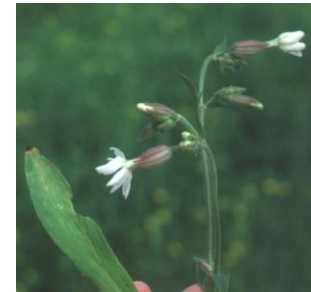
White campion (P)