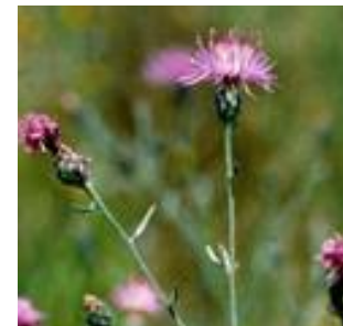
Spotted knapweed (P)