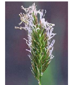
Sweet vernal grass (P)