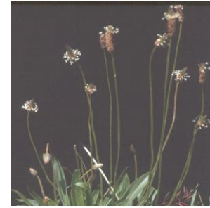
Buckhorn plantain (P)