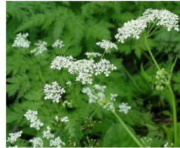
Wild Chervil (B)