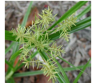
Yellow nutsedge (P)