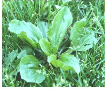
Broadleaf plantain (P)