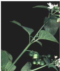
Black nightshade (A)