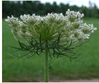
Wild carrot (B)