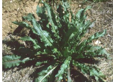
Curled Dock (P)