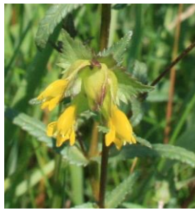
Yellow Rattle (A)