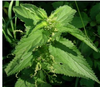
Stinging nettle (P)