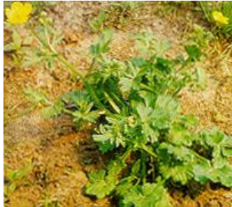
Buttercup spp. (P)