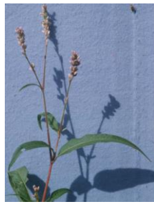
Penn. Smartweed (A)